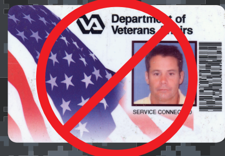
SAMPLE VA CARD NOT ACCEPTED AS A VALID PROOF