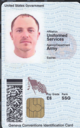
SAMPLE ACTIVE DUTY CARD MUST HAVE BRANCH OF SERVICE, NOT DOD CONTRACTOR