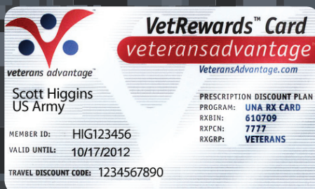
VETERANS ADVANTAGE CARD ALL OTHER ID'S ARE UNACCEPTABLE