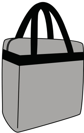
12" X 6" X 12" CLEAR PLASTIC BAG