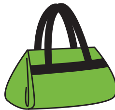
6" X 6" X 6" OPAQUE BAG