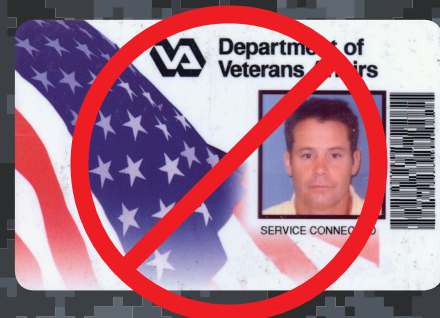
SAMPLE VA CARD NOT ACCEPTED AS A VALID PROOF