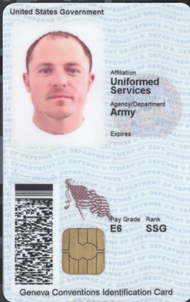
SAMPLE ACTIVE DUTY CARD MUST HAVE BRANCH OF SERVICE, NOT DOD CONTRACTOR