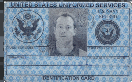
SAMPLE RETIRED CARD