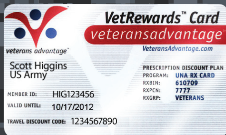
VETERANS ADVANTAGE CARD ALL OTHER ID'S ARE UNACCEPTABLE