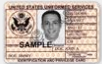
DEPENDENT ID CARD