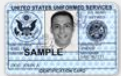
RETIRED ID CARD

MUST HAVE BRANCH OF SERVICE NOT DOD CONTRACTOR