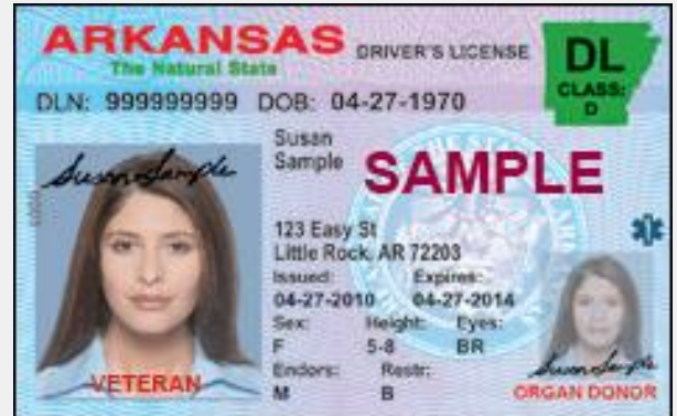
VETERAN STATUS ON DRIVER LICENSE

CLICK LINK TO SEE SAMPLE FROM YOUR STATE: https://militarybenefits.info/veterans-id-on-drivers-license-id-card-by-state/