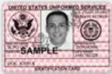
DEPENDENT OF RESERVE / RETIRED RESERVE ID CARD