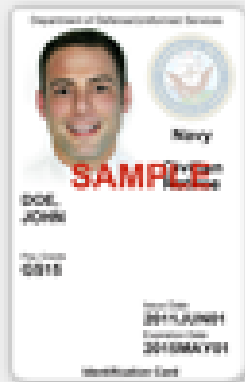
ACTIVE DUTY ID CARD

MUST HAVE BRANCH OF SERVICE NOT DOD CONTRACTOR