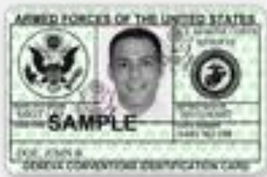
RESERVE ID CARD