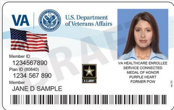
VETERAN HEALTH IDENTIFICATION CARD